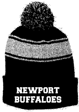
Sport-Tek® Stripe Pom Pom Beanie. STC28